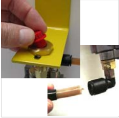
1. Remove plug from inlet and short shipping tubes from fittings.