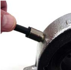
7. Insert the other end of the tubing in lube point fitting.