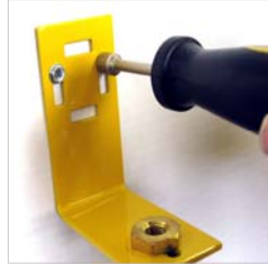
2. Install mounting bracket in an easy access location.