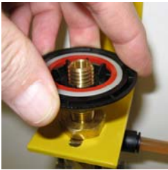
4. Gently press the black timing ring holder onto the MEMO fitting.