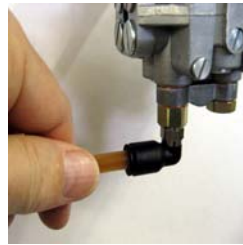
6. Cut tubing to the desired length. Insert into the distribution valve fittings.