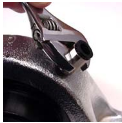
5. Install the tubing fitting on bearing or lube point.