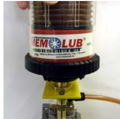
8. Screw the MEMOLUB® lubricator onto the MEMO fitting. Your MPS System is ready to go!

The MEMOLUB® MPS is primed before shipment and is ready for use. On first installation of the MPS system, all lube lines and bearings should be pre-charged with the same lubricant that was ordered with the MEMOLUB® lubricator (prefilled tubing is available and sold separately).