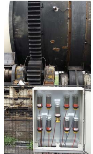
Waste treatment facility