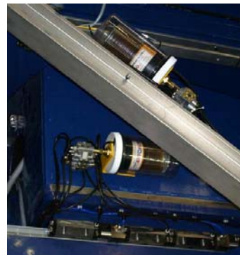
Production equipment application