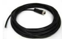
Wire Extension Kits